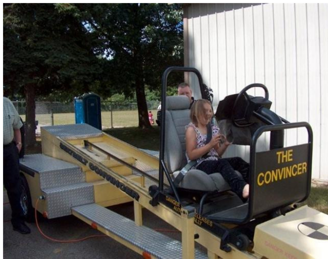
Lee Township officers provided a simulated crash experience to promote seat belt safety.