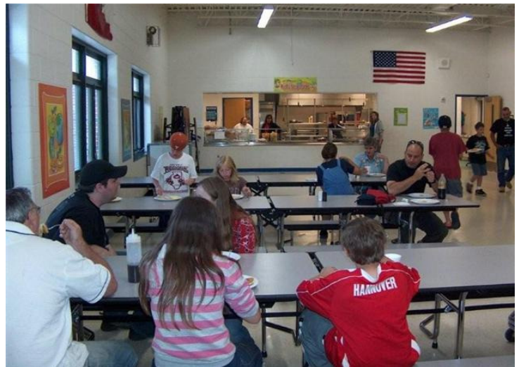
The day started with a hearty pancake breakfast.