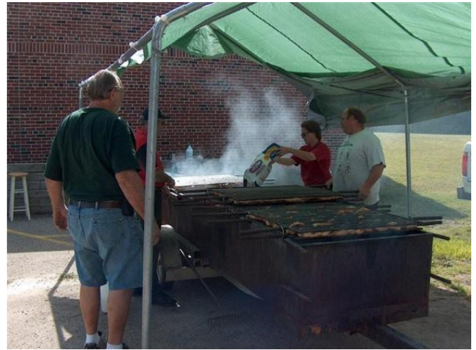
BBQ chicken was one of many tasty treats available.