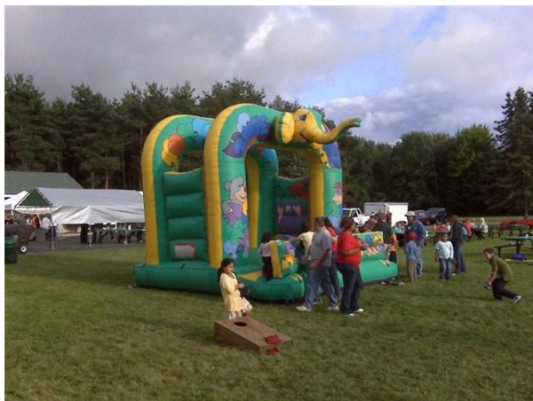
Annual Community Pig Roast sponsored by People Helping People