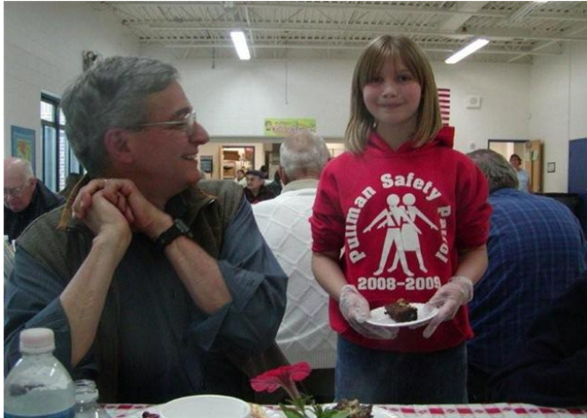
Safety Patrol student at Pullman Elementary School Senior Luncheon.