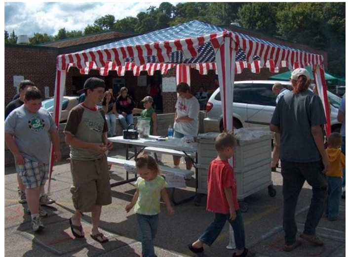
Children and adults had a sweet time at the cake walk.